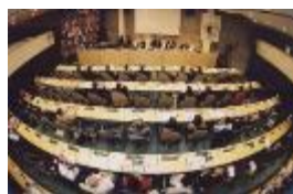
EPPO Council Session